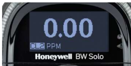
Easy to read