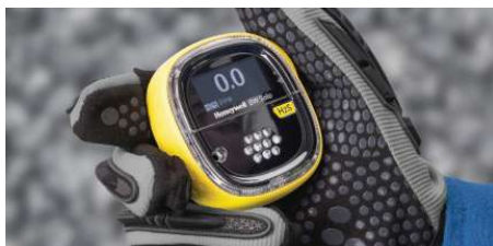
Easy to handle